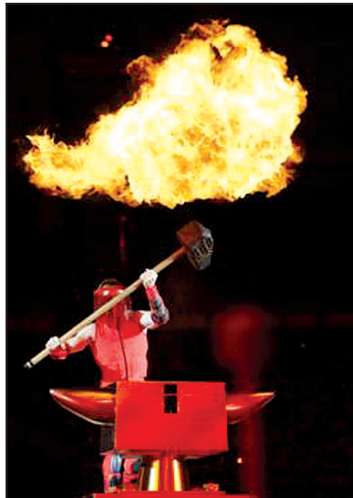
Torino used the Games as catalyst for urban renewal, redefining the city from its industrial past to a cultured, or “hot”, place to be.

Royal Roads University and Real are hosting the Olympic Communication Research Consortium (OCRC), an online clearinghouse for Olympics research in general and preparations for the Vancouver 2010 Games in particular. The OCRC is assembling an online interactive network of Canadian and international communication researchers examining aspects of the Olympics and invites people to submit their research and engage with them in e-dialogues.