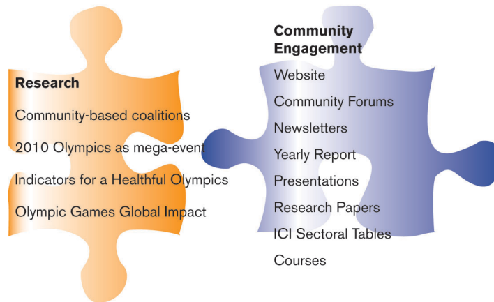
The 20/20 Project will inform IOCC advocacy and promote community engagement.

For more on the 20/20 Work Plan see: www.olympicsforall.ca/research.htm